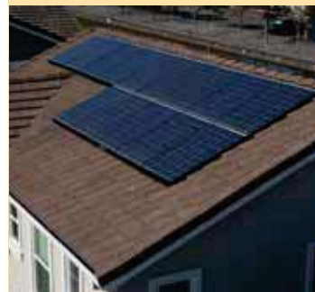
Black frame improves aesthetics for residential roof top applications

The ND-Q250F7 module is covered by both the Sharp 10-year limited warranty on materials or workmanship as well as the 25-year limited warranty on power output.