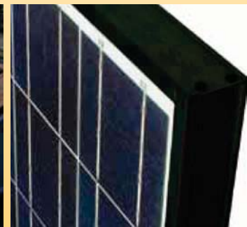
Tempered glass, EVA lamination and weatherproof backskin provide long life and enhanced cell performance.