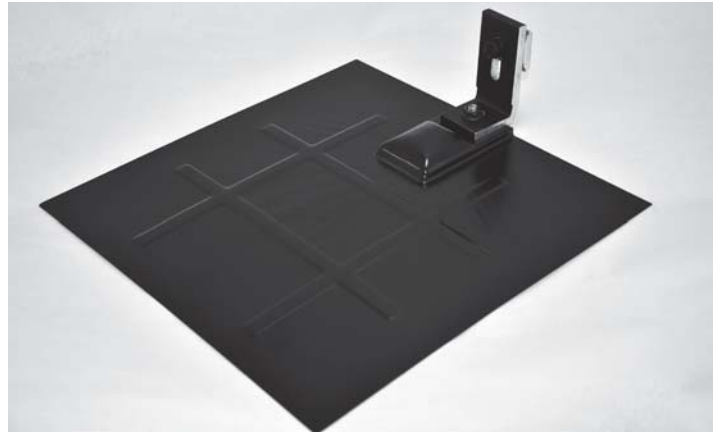
Flashed L Foot Kit Assembled