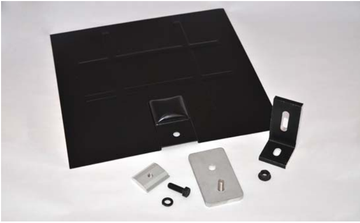
Flashed L Foot Kit Parts